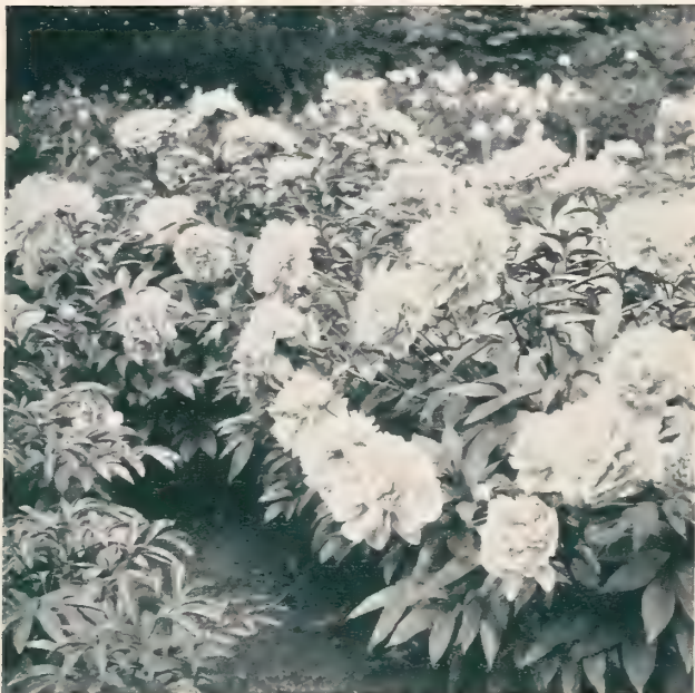
A Bed of Therese Peonies

Those who are fond of Peonies will be delighted with these modern marvels which the skill of the hybridizer has given us. They will thrive in almost any situation, but prefer a sunny spot and medium heavy, but well-drained and fertilized soil. Plant them 3 to 4 feet apart and with the crown of the root 4 or 5 inches below the surface level. Give extra attention to cultivation the first two years after planting and, if you want the finest specimen plants, pinch off all buds which appear before the third season. Plenty of moisture is required during the blooming period. We offer ten of the finest standard varieties in cultivation.